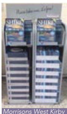
Morrisons West Kirby